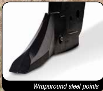
Wraparound steel points