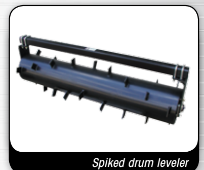
Spiked drum leveler