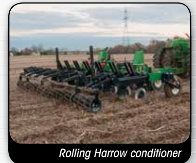
Rolling Harrow conditioner