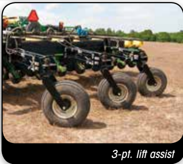
3-pt. lift assist