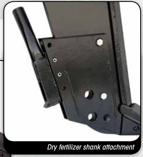
Dry fertilizer shank attachment