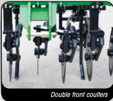
Double front coulters