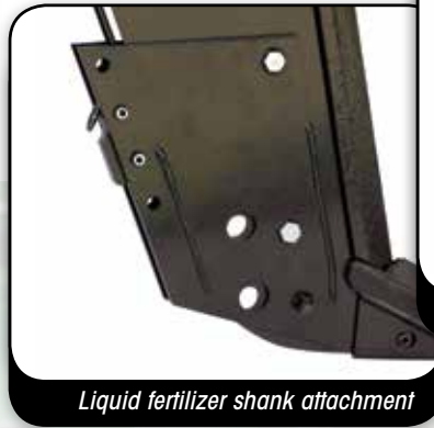
Liquid fertilizer shank attachment