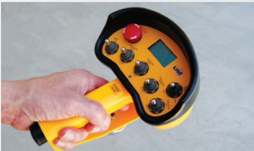
6-function wireless remote