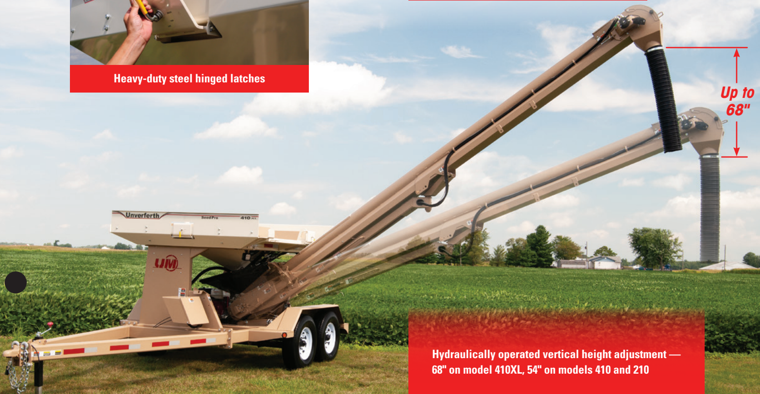
Hydraulically operated vertical height adjustment — 68" on model 410XL, 54" on models 410 and 210