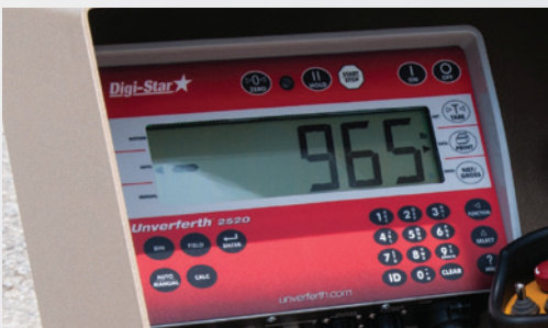
Model 2520 scale package