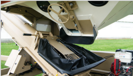
Large collapsible canvas hopper

As Mother Nature proves yearly, efficiency is your most valuable ally during planting season. The Unverferth Seed Pro® bulk box seed tenders boost your efficiency by delivering four or two 50-unit seed boxes directly to your planter or drill. You can even position the patented conveyor parallel to the Seed Pro tender for transferring seed from one container to another for dual purpose seed handling versatility.