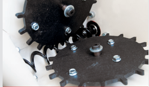
Internal agitation prevents bridging