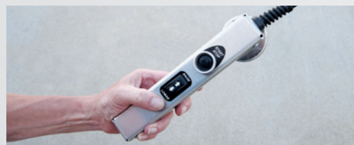
Standard wired remote