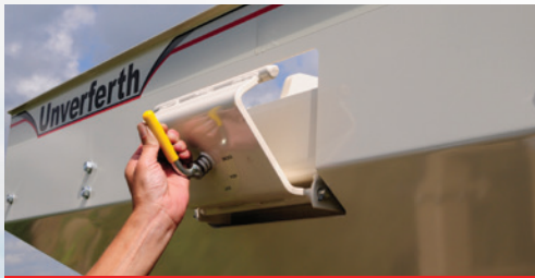
Heavy-duty steel hinged latches