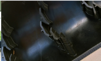
Cupped rows of offset cleats