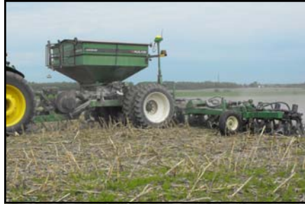
Use for strip-till application