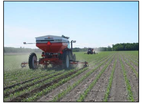
Use for side-dressing application