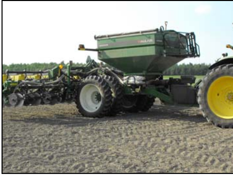
Use with a planter