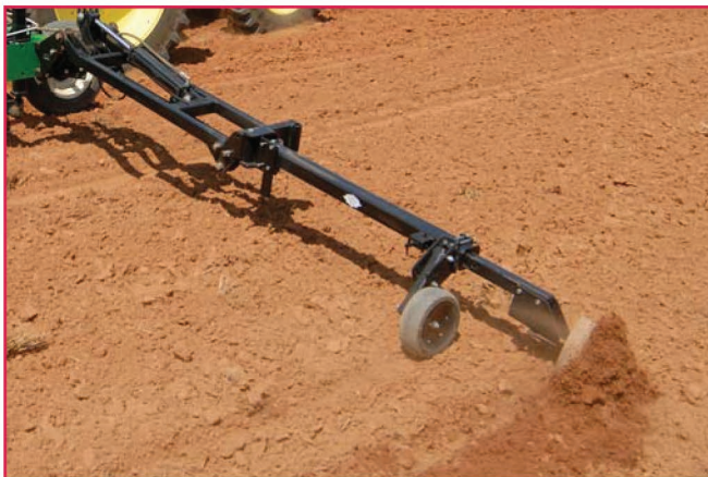
Optional shear-bolt protected row markers with notched blades leave a highly visible mark. An optional gauge wheel package for row markers on 6- and 8-row models ensures constant depth in soft soil conditions.