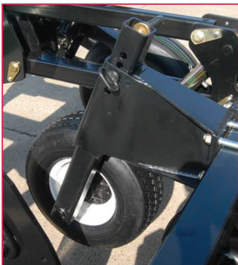
Optional bedding disk gauge-wheel package