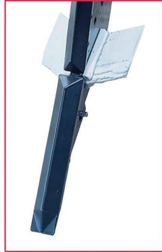
Replaceable raised-center, hard-surfaced subsoiler points for breaking hardpan with minimal soil disturbance are standard.