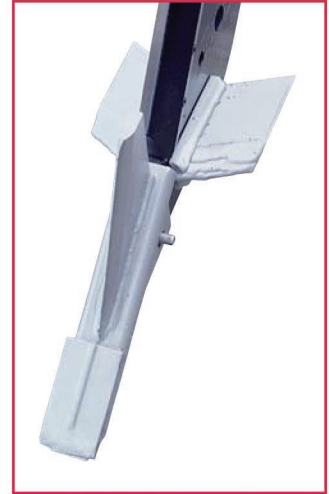
Shark fin points for even less surface disruption are also available. Optional angle-adjustable shatter wings provide additional subsoil fracturing.