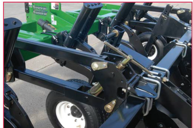
Bedder arms with parallel-link design