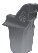
Tooth type A/HD (option)