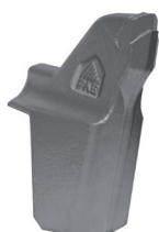
Tooth type A (standard)

Data refers to the machine without options.