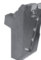
Side scraper Type MH