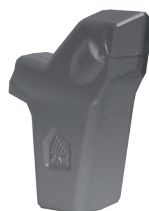
Tooth type F (option)