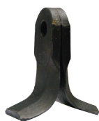
Hammer type "Y"