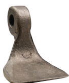
Hammer type "PML"

Data refers to the machine without options.