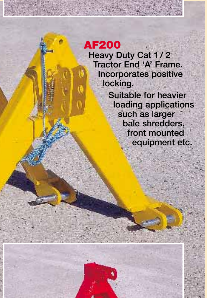
AF200 Heavy Duty Cat 1 / 2 Tractor End 'A' Frame. Incorporates positive locking. Suitable for heavier loading applications such as larger bale shredders, front mounted equipment etc.