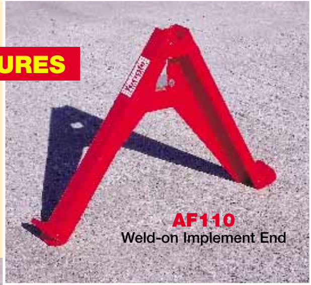
AF110 Weld-on Implement End