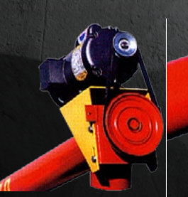
Portable 4" auger, adjustable motor mount, shielded single "A" belt and pulley, and pre-lubricated top end bearing.

21' BASIC AUGER 5', 10' or 15' EXTENSION