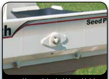
Heavy-duty steel hinged latches