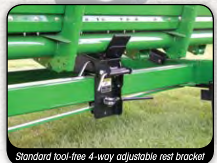
Standard tool-free 4-way adjustable rest bracket