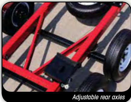
Adjustable rear axles