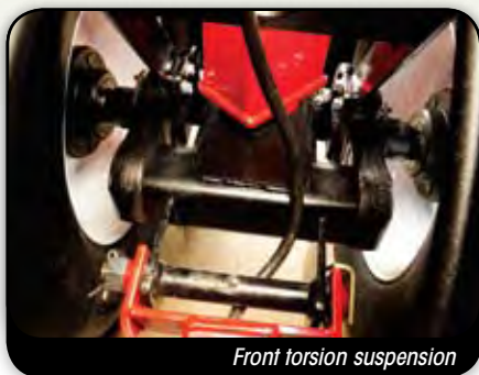
Front torsion suspension