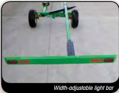
Width-adjustable light bar