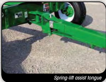
Spring-lift assist tongue