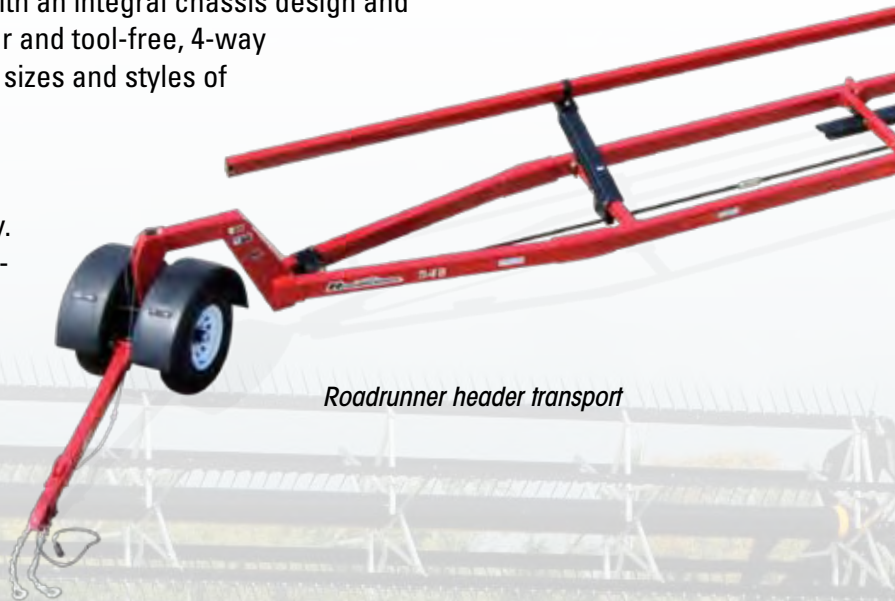
Roadrunner header transport