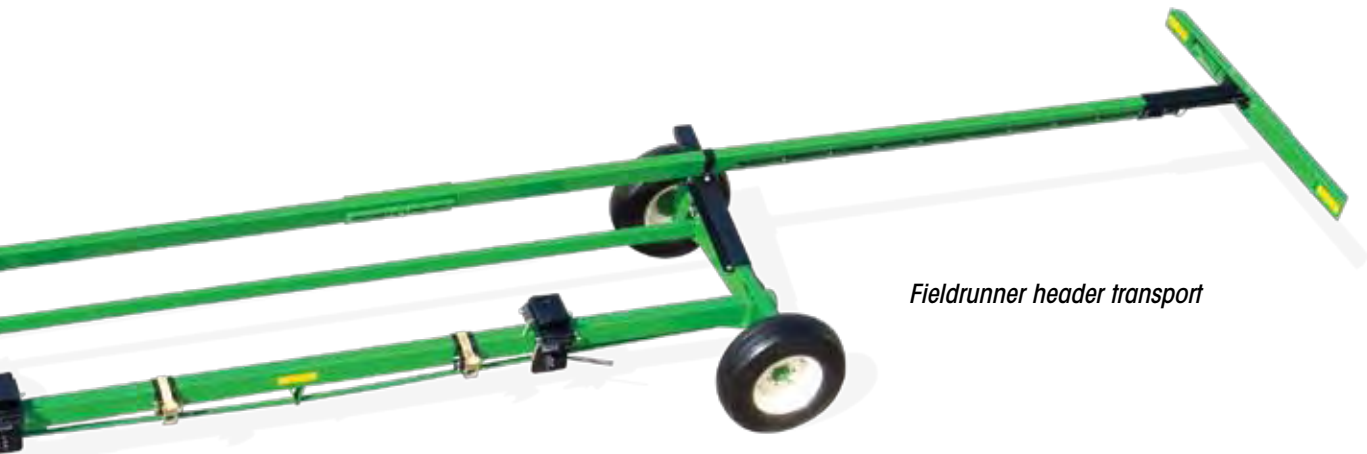
Fieldrunner header transport