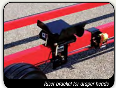
Riser bracket for draper heads