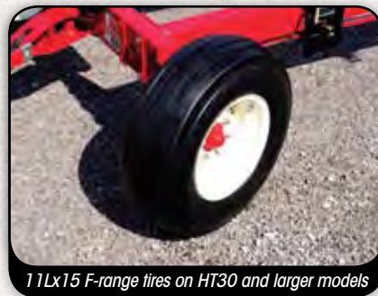
11x15 F-range tires on HT30 and larger models