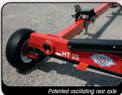
Patented oscillating rear axle