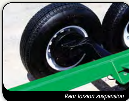
Rear torsion suspension