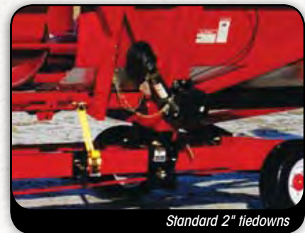
Standard 2" tiedowns