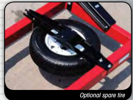
Optional spare tire