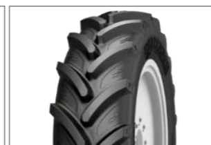
R-1W (ag tread) tire – utility tread, hard or wet surfaces.