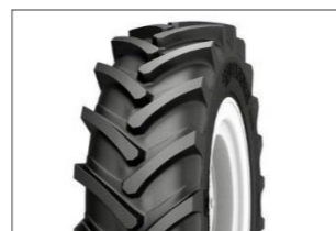
R-1 (ag tread) tire – standard tread