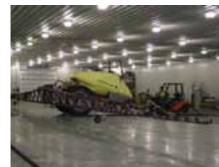
HARDI Test Center, Davenport, IA