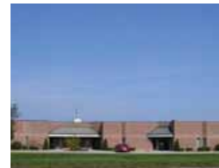
HARDI North America, London, ON

Since 1957 HARDI has committed to the ever-increasing demands for efficient and precise plant protection. HARDI is the trendsetter within application of crop protection products. To achieve this position continued developments and innovation are essential. HARDI is committed to the long term future of plant protection.