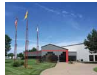
HARDI North America, Davenport, IA

HARDI INTERNATIONAL A/S is an international group whose basic idea is to satisfy the user's requirements for quality products which ensure efficient, punctual and precise application of crop protection products. Our world-wide distribution and sales network comprise more than 100 countries where we are represented by importers, agents and sales subsidiaries. These are situated in Sweden, Norway, Denmark, the UK, France, Spain, North America, Germany and Australia.