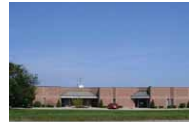
HARDI North America, London, ON