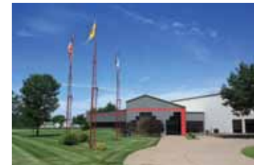
HARDI North America, Davenport, IA

Since 1957 HARDI has committed to the ever-increasing demands for efficient and precise plant protection. HARDI is the trendsetter within application of crop protection products. To achieve this position continued developments and innovation are essential. HARDI is committed to the long term future of plant protection.