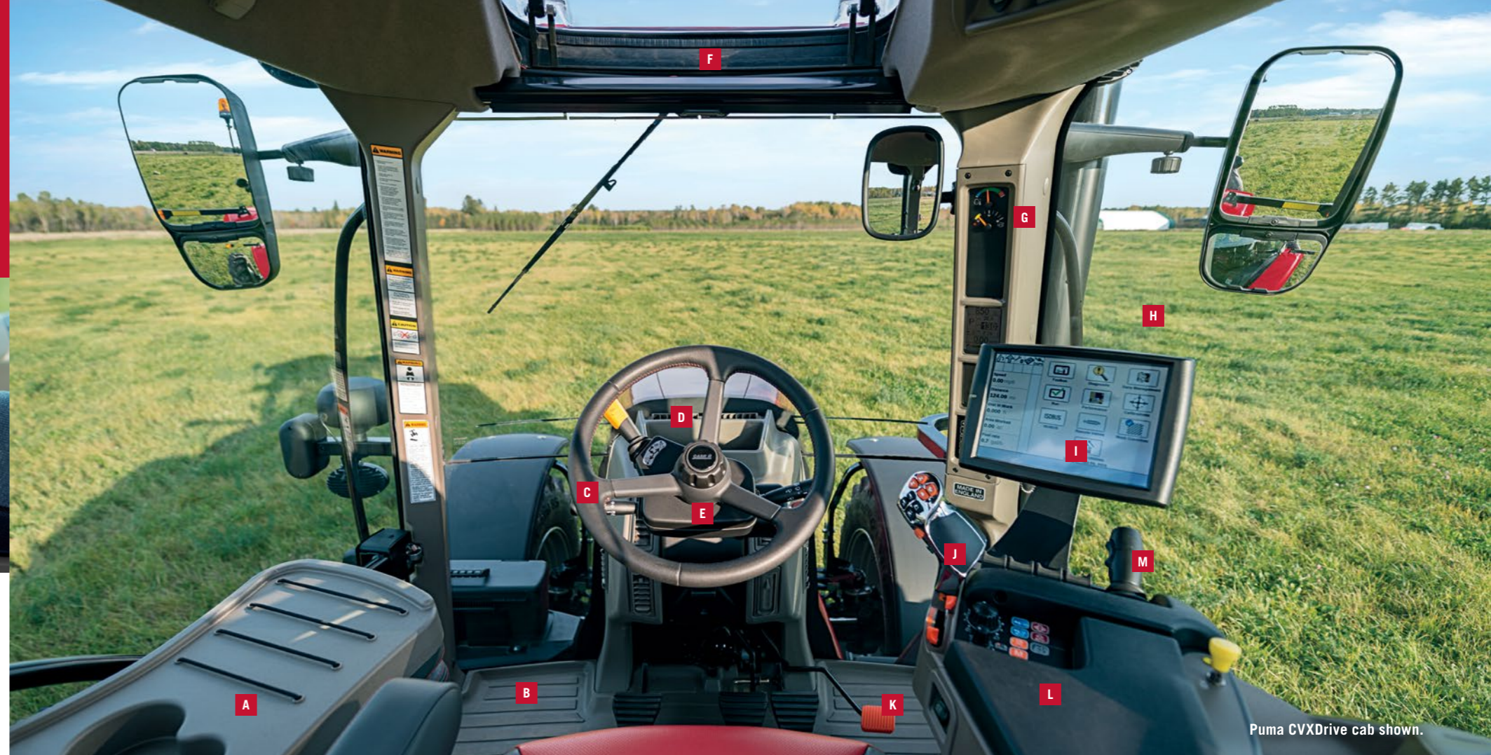
Puma CVXDrive cab shown.