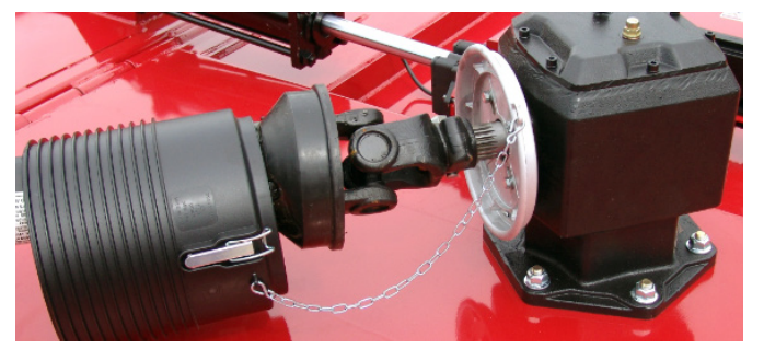
The quick detach shields allow easy access to the driveline clutch and grease fittings.