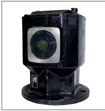
Patented oil sight gauge in all three cutting gearboxes for quick and easy monitoring of oil level.