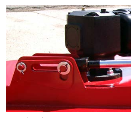
Wing free float is 22° down and 25° up without movement of hydraulic cylinder rod for extended cylinder life.