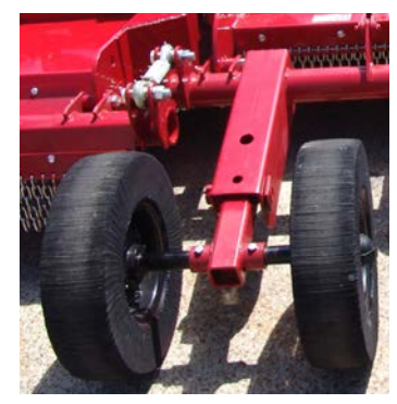
Each axle arm on the center section has a rubber cushion to absorb the shock loads near the wheel.