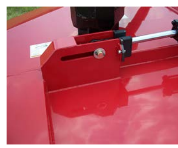
The "free wing float" slot allows the wing to float up and down without moving the hydraulic cylinder rod. This extends the life of the cylinder components.