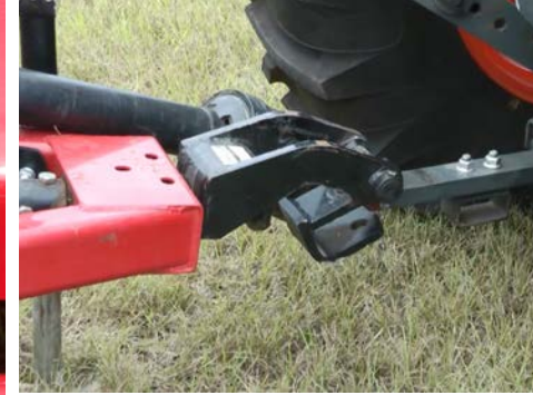
A one person operation, the tractor drawbar is easily backed into the Perma-Level hitch. Notice correct position of hitch.