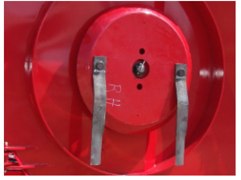
The circular formed deck rings position outside of the blade carrier, reduce the possibility of a bent blade cutting the deck plate.