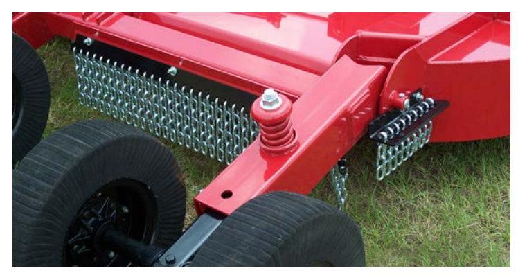
Each axle arm has a strategically placed spring cushion to absorb shock loads near the wheels.