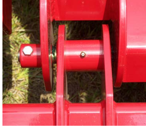
For long axle life, all pivot points have grease fittings and wear bushings.

All Flex-wings undergo extensive testing in all growth conditions to ensure each meets our demanding performance requirements.