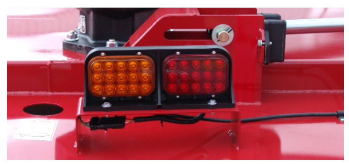
Highway lights are standard equipment. Lights provide flashing and turn signals.