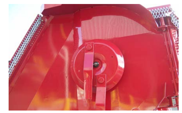
The design of the wings adds exceptional strength in the gearbox stands without the use of exposed structure.