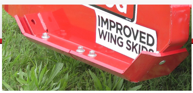
The wing skids are in two pieces for more economical replacement and the 45 degrees of up- turn allows the skid to float over the ground instead of gouging in. This prevents possible damage to the sideband.