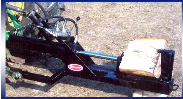
3ph Horizontal 20 Ton Push, 4 x 24 Cylinder