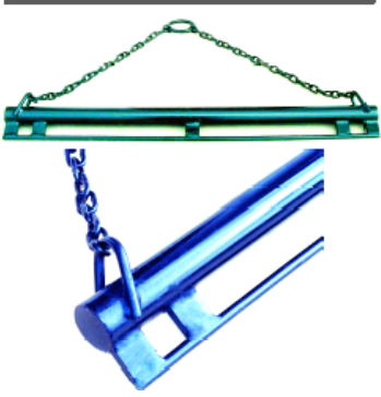
Heavy Duty Universal Drawbar