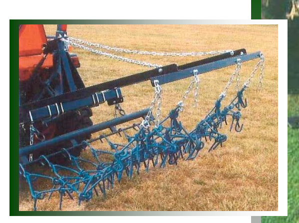
3ph Units from 4' to 12'