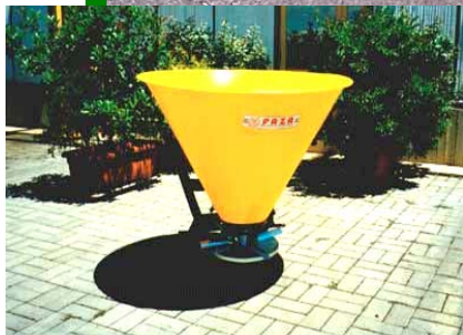
Available with yellow PVC hopper.