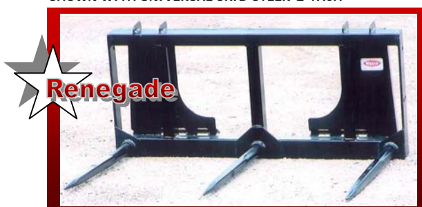
SHOWN WITH UNIVERSAL SKID STEER Q-TACH

Not to be used for carrying 2 bales stacked on top of each other without optional guard shown below