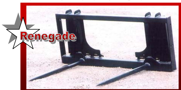
SHOWN WITH UNIVERSAL SKID STEER Q-TACH

2000 lb. Capacity @ 24" Load Center Available with 39" or 49" tine 2 Stabilizer tines