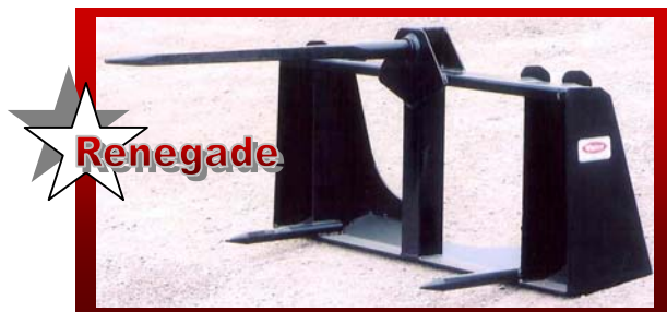
SHOWN WITH UNIVERSAL SKID STEER Q-TACH