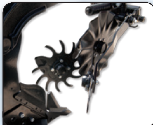
The optional floating row cleaner easily attaches to the coulter and features independent height adjustment, curved single-finger design and adjustable spring downpressure to easily follow ground contours.