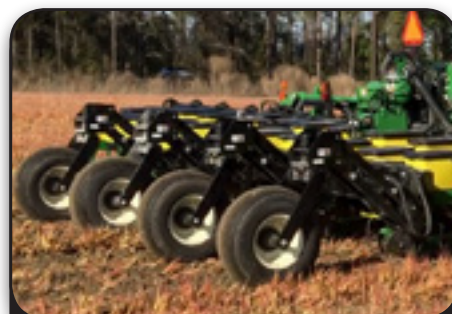
Semi-mounted lift-assist packages that mount directly to 8-, 12- and 16-row planters.

Additional options include transport light package for safer road travel, shank-mounting extension kits for staggering the shanks rearward, fertilizer injectors, pull-through hitch for towing fertilizer carriers and row markers.