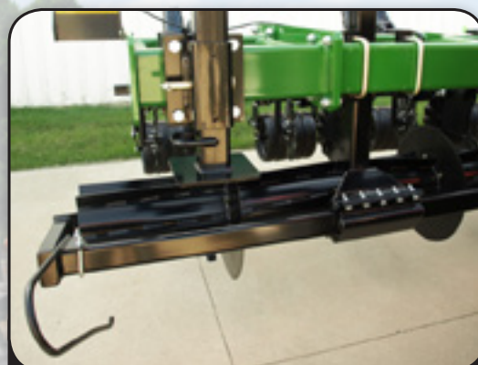
The cover crop roller features chevron-patterned blades that crimp and deflect residue away from row and a smooth coulter blade to create a path for the shank. Torsion-flex mounting allows rollers to follow ground contours and go up and over field obstacles.