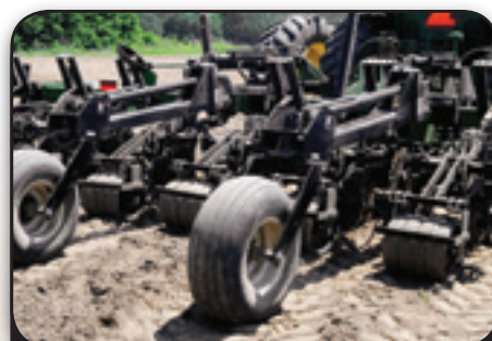
Optional hydraulic lift-assist option for more easily raising the Ripper-Stripper unit.