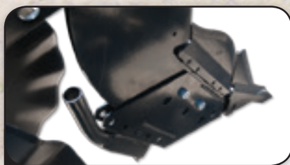
Depth-adjustable dry or liquid fertilizer injectors can be mounted to deep-till shanks for in-row fertilizer placement for optimum nutrient uptake.