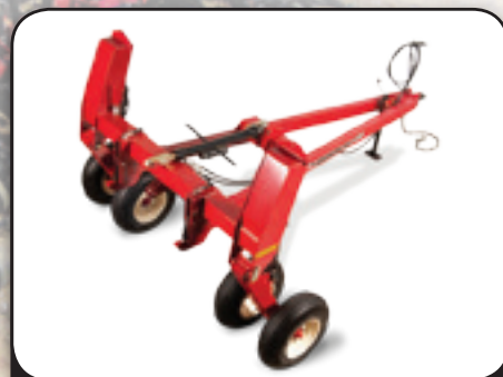
Easily convert any size Ripper-Stripper implement to pull-type operation with model 700, 500 or 300 implement caddys, or pull-type, bolt-on conversion packages.