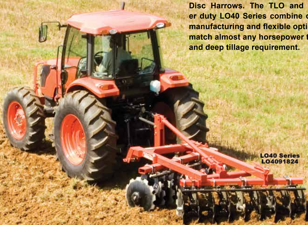
LO40 Series LO4091824

Tufline offers two series of Offset Lift Disc Harrows. The TLO and heavier duty LO40 Series combine quality manufacturing and flexible options to match almost any horsepower tractor and deep tillage requirement.