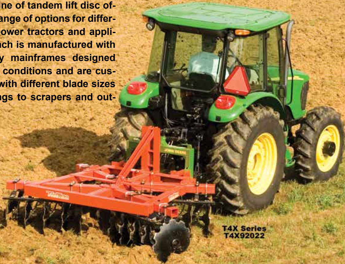
T4X Series T4X92022

Tufline understands the needs of the agriculture community which is why their line of tandem lift disc offers a full range of options for different horsepower tractors and applications. Each is manufactured with heavy duty mainframes designed for rugged conditions and are customizable with different blade sizes and spacings to scrapers and outrigger kits