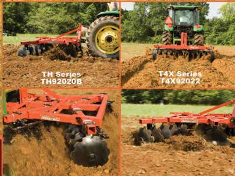
TH Series TH92020B