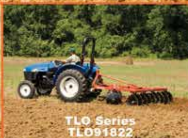
TLO Series TLO91822