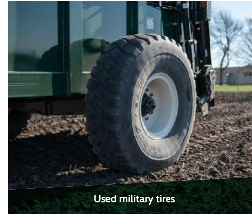
Used military tires