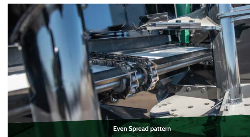
Even Spread pattern

Slip resistance and color-coded hydraulic grips make hooking up a breeze. A bolt tensioning system allows for in-the-field chain adjustment. Grease points maintain smooth machine operation and can be easily accessed.