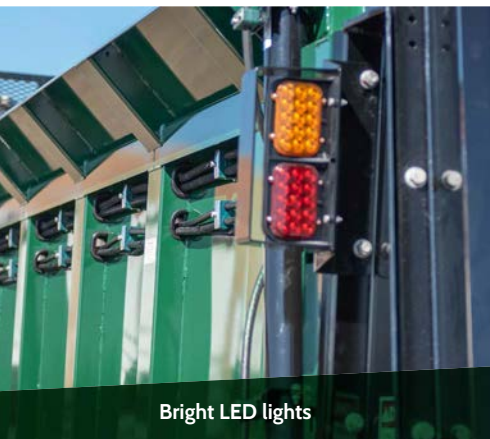
Bright LED lights