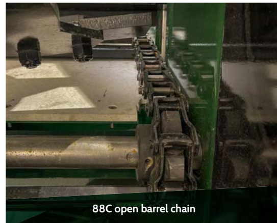
88C open barrel chain