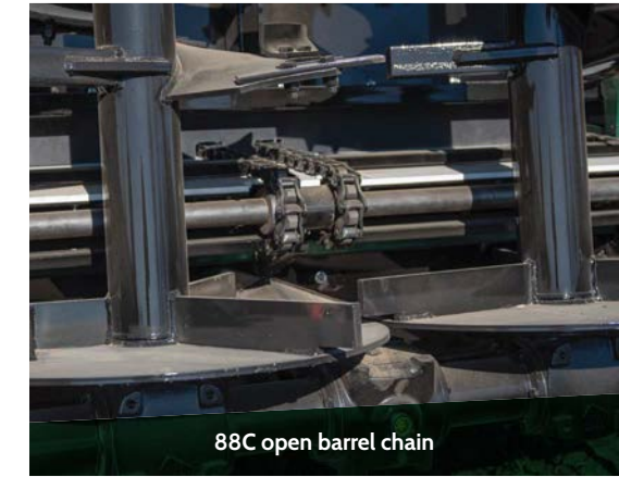
88C open barrel chain