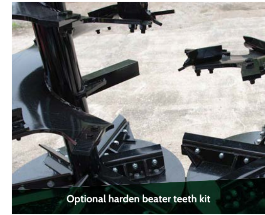
Optional harden beater teeth kit

Art's Way beaters get even better with our litter paddle kit. This option allows you to maintain a more consistent spread pattern with even the finest materials.