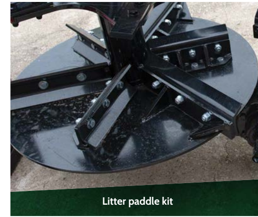
Litter paddle kit

A scale option to meet the needs of any operation. Monitor your load weight and application poundage with the GT400 indicator on NT560 Indicator. Get precise flow control with the complete Raven System.