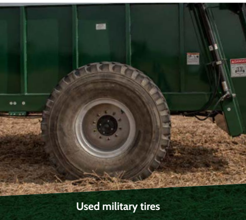
Used military tires