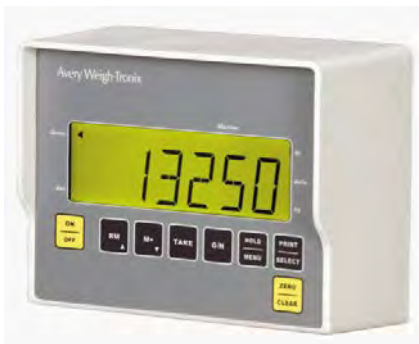
Model: Weigh Tronix 640/640XL

Simple Gross/Tar/Net weight indicator with adjustable back lighting, selectable weight filtering, 100 memory channels with individual statistics.