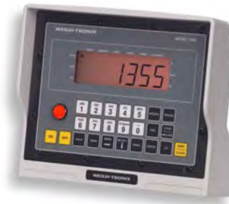
Model: Weigh Tronix 1040/1040XL

Simple Gross/Tar/Net weight indicator with adjustable back lighting, selectable weight filtering, 100 memory channels with individual statistics.