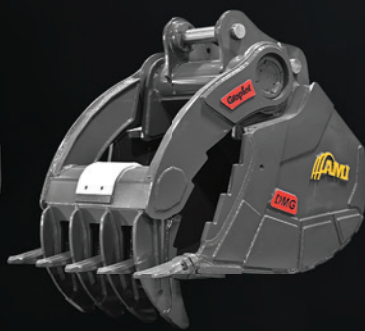
GRAPTOR® DEMOLITION BUCKET *Shown with optional replaceable teeth on thumb tines