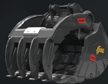
GRAPTOR® DEMOLITION ROCK SCREENING BUCKET