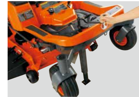
Maintenance Lift (Optional)

Maintenance doesn't get any easier. The seat panel lifts up for quick access to the HST, the hood opens for routine maintenance (adding oil, etc.), an operator platform hatch makes upper mower access a snap—and all three can be opened at once. Plus, Kubota's optional tilt-up lift feature is also available for routine maintenance underneath the mower.