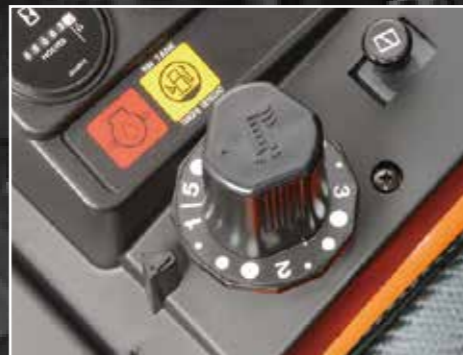
1/4" Increment Cutting Height Adjustment