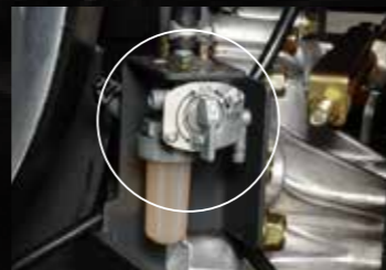
Carburetor Drain Cock*

*When in use, consult operator manual and handle with care.