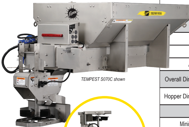
TEMPEST S070C shown