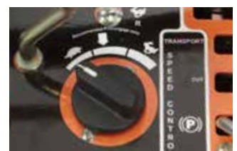
Dial-Type Throttle Control (52-inch model)